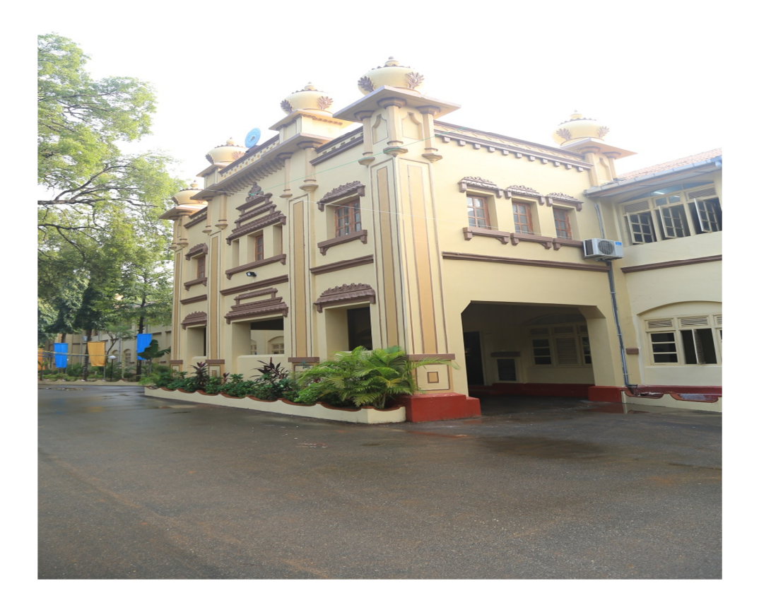
Administration Block, University of Jaffna

The Dean's office will entertain students' appeals in a prescribed format.