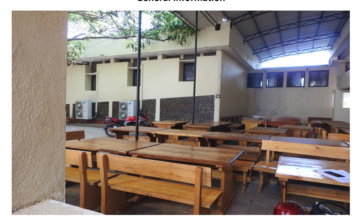
Student Study Area